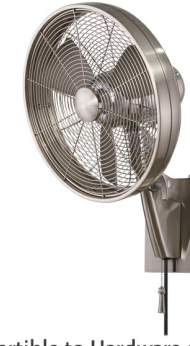
Convertible to Hardware or Wall Plug